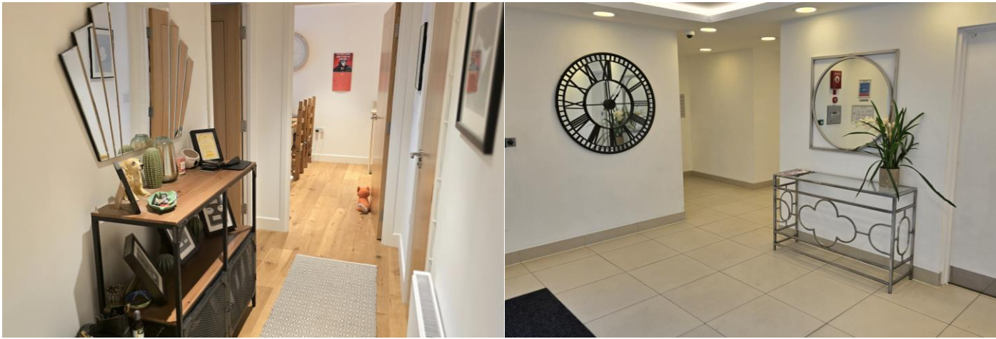
Approximate Gross Internal Area 74.0 sq m / 796.52 sq ft